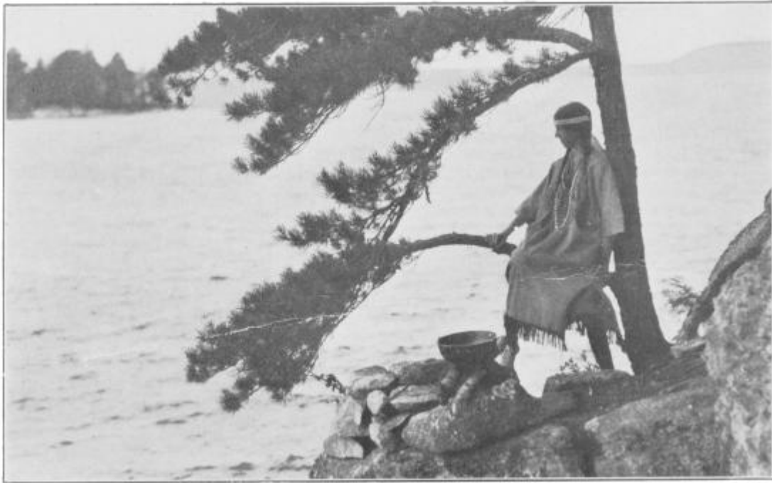
A favorite rendezvous at the camp

213“Let’s hurry down to the landing to meet them,” Mary Hastings proposed, and instantly the whole group turned and raced back to camp to leave the glass, with the joyous announcement, “Miss Laura’s coming, and Olga. We’re going to the landing to meet them.” And waiting for no response they sped through the pines to the landing-steps, Elsie snatching up a flag as she passed her own tent.