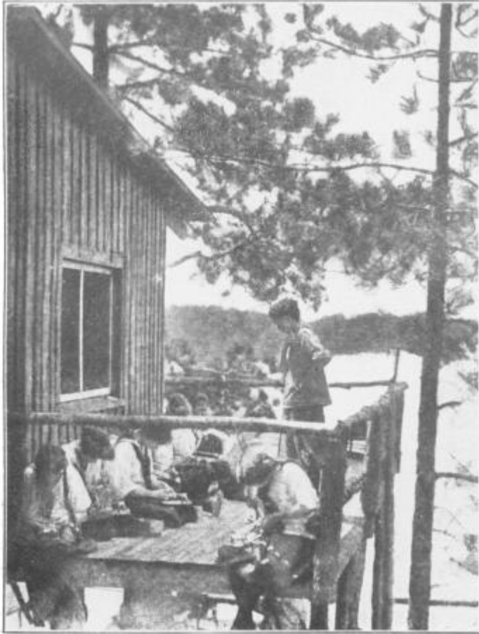
A group of girls busy over beadwork